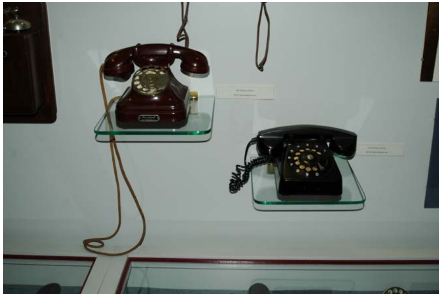
Figure 2: Early telephones: 1934 and 1954 4

Other social technologies have radically changed societies in recent history such as the automobile, telephone, radio and television. However, unlike the internet, these technologies remained fairly static in many ways. For example, cars are still used primarily for transportation, telephones for voice or text exchanges, radios and televisions to receive (and not send) programs. Similarly, remember Henry Ford's quip, "[the car] can be any color, so long as it's black"? Though all cars are no longer black, but, as the photo below illustrates, the pace of change has been slow. Though manufactured decades apart, these telephones are strikingly similar.